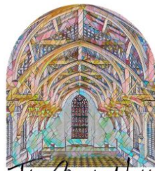
The Great Hall AT ST. MARY'S